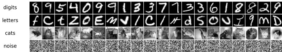
Figure 1: Different concepts used for our statistical experiments